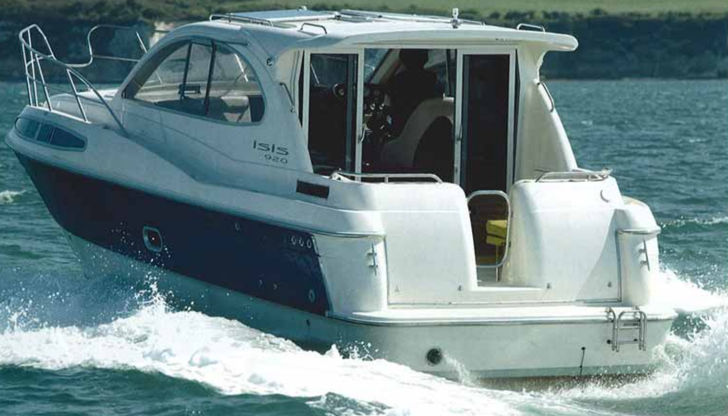
above With the 240hp engine fitted, the Isis 920 was extremely steady at all speeds, though occasionally noisy and with quite heavy steering

down at a lower level, rather than in a sideboard as tends to be the norm on this style of boat. Even so, there is still room for two usable cabins with good-sized berths, and they are both en-suite, in so much as they each have private access to the same toilet compartment.