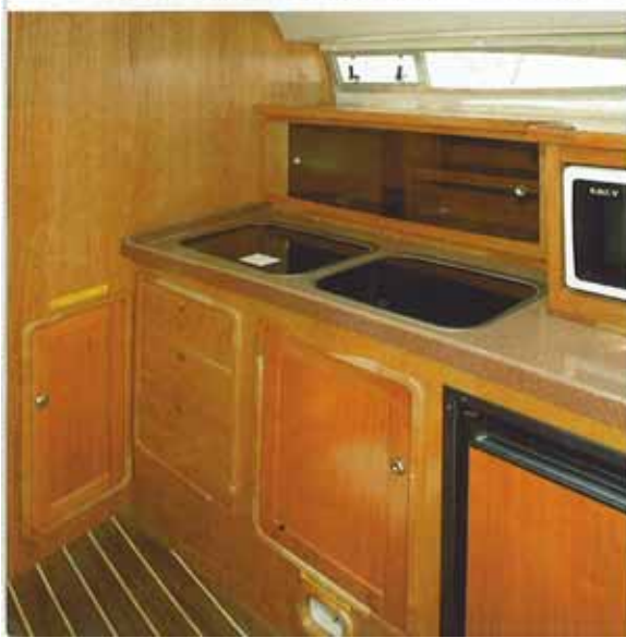
below A spacious cooking area, an 'en suite' WC with three entrances and homely cabins add to the comfort of any cruise.

A few easy steps drop you down to the galley and the multi-doored forward lobby, with space provided for people to come and go without asking the chef to excuse them.