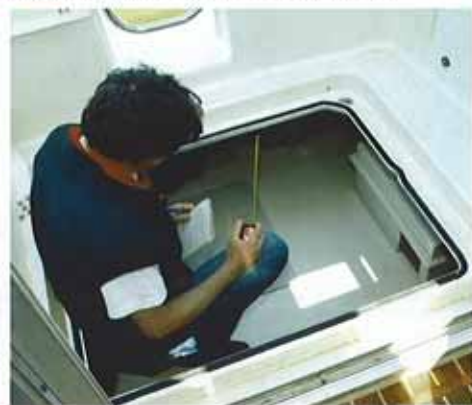
below Another example of inventive locker room.