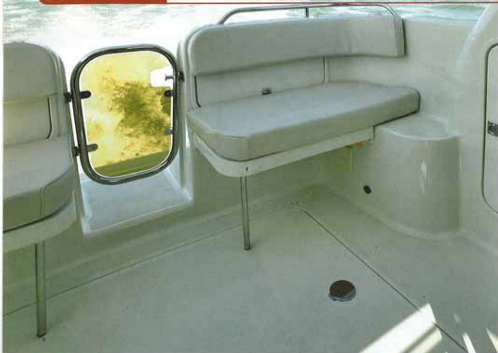
above The cockpit has space for extra seats. When none are needed, these benches can be stored away.

migrate to the bilge. Although some of the tanks take up space here, there is still plenty of useful stowage for the essential items you just can't do without.